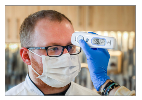
Non-contact, 1-second readings for quick, safe screening.

*FDA-cleared for safety & accuracy for kids and adults. ThermoWorks Wand Thermometer measures infrared energy radiated from the skin at the center of the forehead area. This captured energy is collected through the lens and converted to a body temperature value (displays oral equivalent temperature).