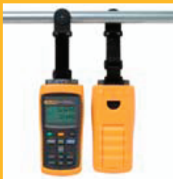
TPAK Magnetic Hanger