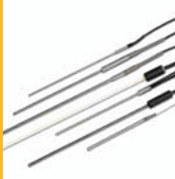
Calibrated Temperature Sensors

A wide array of accessories is available to help you maximize productivity, but the following are essential for most users.