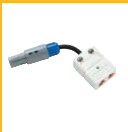
Universal Thermocouple Adapter