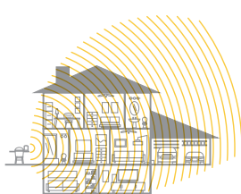
ThermoWorks Smoke X